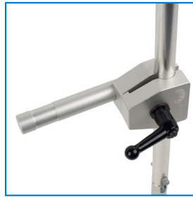
3760 Panel Clamp