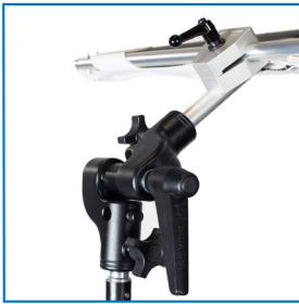
1852 Panel Lantern Pro Kit