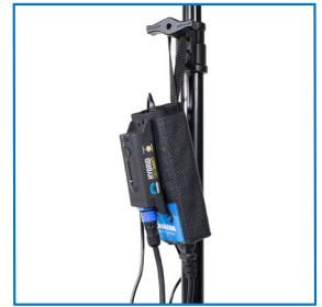
Controller + Pouch