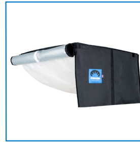
Fabric Lantern and optional Skirt Kit