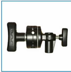
3750 Grip Head