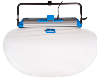
ARRI SKYPANEL LANTERN