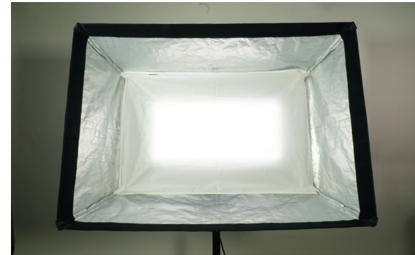
Shown with baffle installed - front screen removed

Installing Removable Front Screen – With the Chimera label facing the front of the Lightbank, attach the screen to the Lightbank. For easier installation, align the back edge of the Velcro strip on the Lightbank and work your way around the perimeter.